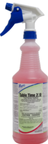
Table Time 200